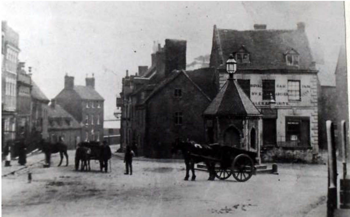
Coleshill Street and the Royal Oak, 1887

Records of the Royal Oak are scarce - it is not listed in the census enumerators books, and the first reference to it by name in the rate books is not until 1897. When it closed, it was owned by the Lichfield Brewery, but when they came into ownership has not been ascertained