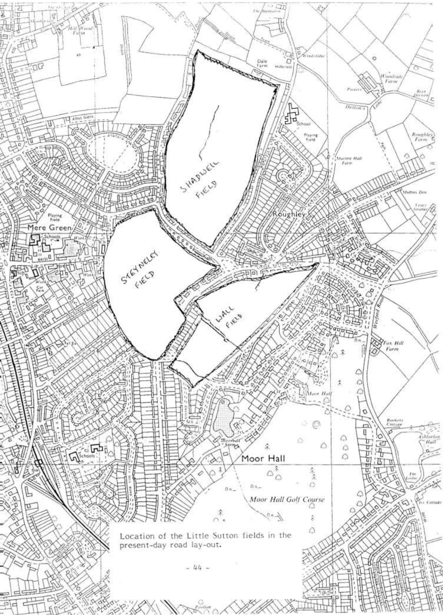
Location of the Little Sutton fields in the present-day road lay-out.