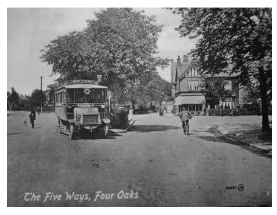
Fig. 1 - Midland "Red" Tilling-Stevens TS3 omnibus, OA4557, at Mere Green, c.1920

Although one cannot appreciate the livery in this monochrome photograph, the bodywork would have been painted 'Midland' red with black mudguards and would have had a silver roof. The distinctive black lining-out would have been edged with gold and there would have been a white destination board with route number along the waist on each side and a central route destination board at both front and rear.