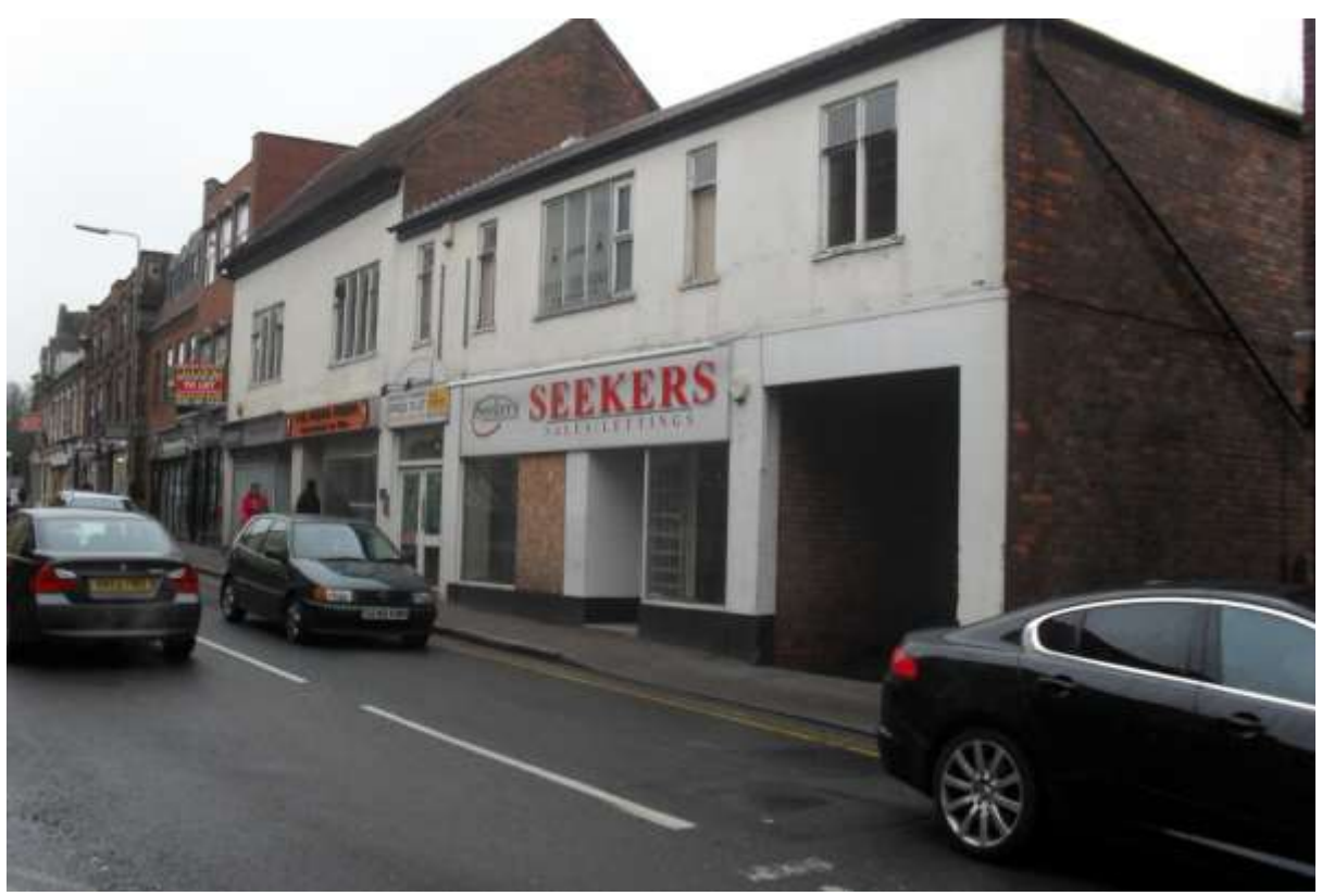
26-30 High Street in February 2011

taken before the roof was replaced (1960s?) shows that the dormer windows had been replaced by skylights.