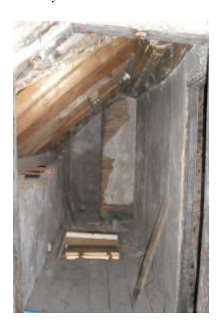
30 High Street, showing the purlins resting on the brick gable and the exposed flues in the wall above the trap door.

We concentrated on the attic room on our visit, as the rest of the building had already been refurbished. The roof was modern except for the oak purlins which were supported by the brick gables; the dimensions of the bricks indicated an eighteenth century date. Also in the roof could be seen the rafters forming the end on the roof of the rear wing and the location of