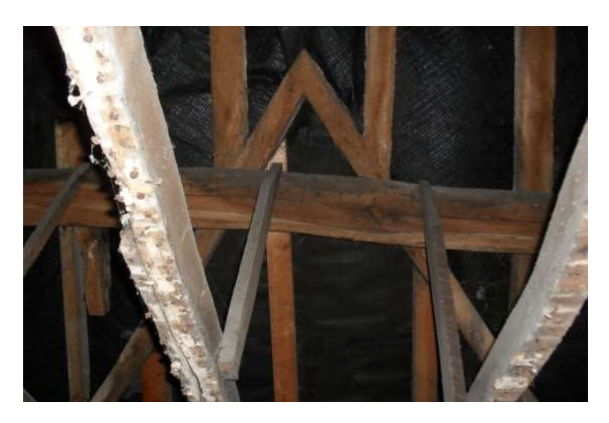
30 High Street showing the rafters at the end of the former pitched roof of the rear wing.

a former dormer window. The chimney flues in the rear wall were exposed as a series of holes in the top of the rear wall.