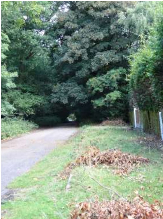
Fig. 4 – The road constructed in 1880 from Midland Gate to the wall of the Four Oaks Estate (Hartopp Gate). The road passes in front of the gateway to Midland Lodge seen on the right of picture.