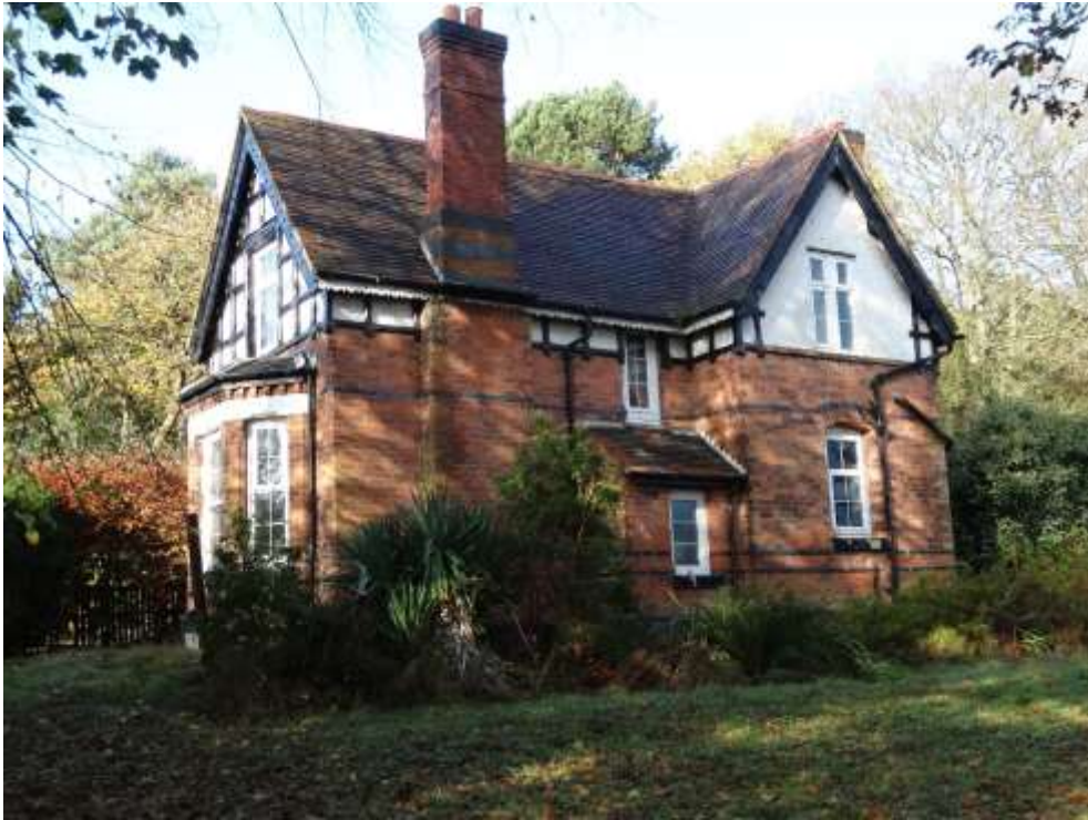
Fig. 17 - The south-eastern aspect of Midland Lodge taken from the bottom of the garden. Note that the garden slopes downwards from north to south as well as from west to east.