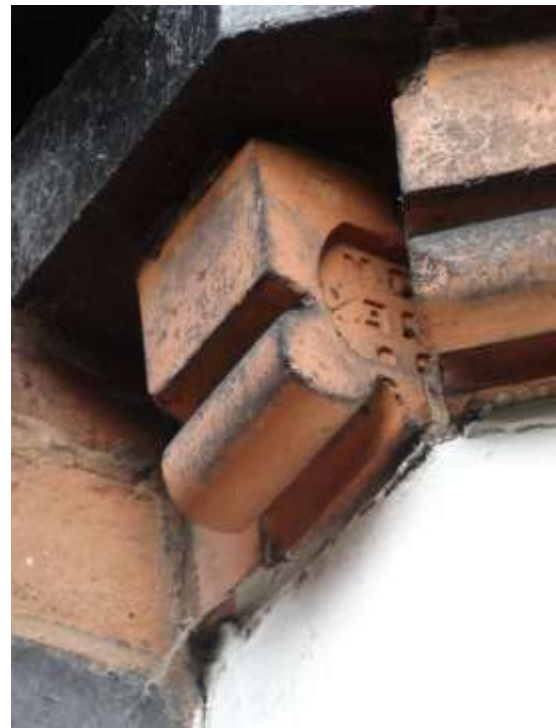
Fig. 17 – Close-up of one of the terracotta dentils showing the brick-makers mark within the frog of the brick. These were only used over the bay of the south-facing reception room.