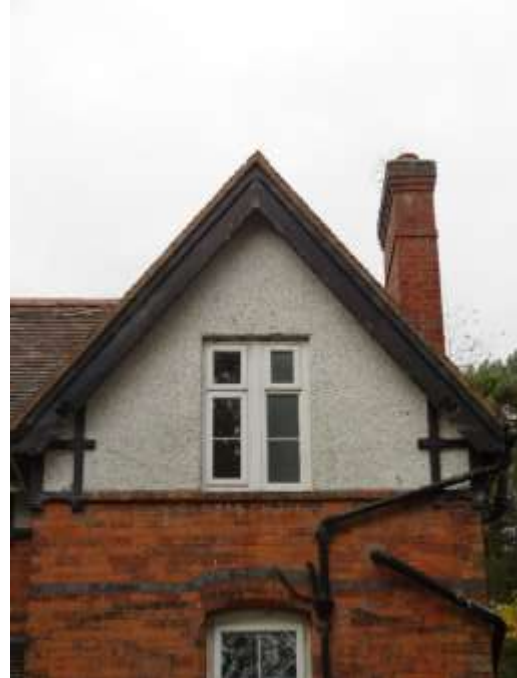
Fig. 9 – By contrast the bargeboards on the east-facing gable at the rear of the cottage have saw-tooth decoration on the lower edges and a single four-leaf clover cut-out at each lower end.