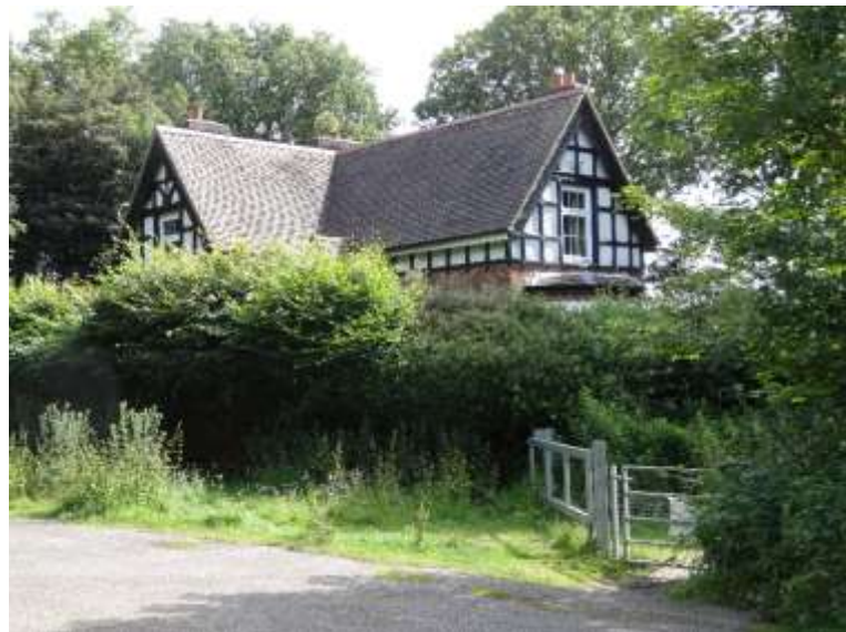
Fig. 7 – The south-western aspect of Midland Lodge with Midland Gate to the right of the picture with the bridge parapet nearest the camera.

When one first encounters the lodge on the roadway leading from Meadow Platt to the Hartopp Gate one is taken aback by its sudden emergence in such sylvan surroundings and one's eye is pleasantly surprised by the attractiveness of its large gable ends and black mock timber patterns set off by three elegant tall chimneys. It is certain that in 1880 there were not as many trees in the vicinity as there are today. The photograph of Midland Lodge (Fig.1a) taken around 1910 depicts a more open location than is the case today when there are far more trees, many of which are quite mature.