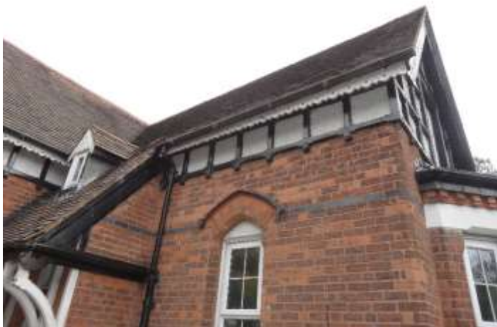
Fig. 10 – These decorated fascia panels with their alternating pattern of triangles and rounds plus piercings flank all of the gables at the front and rear of the house.