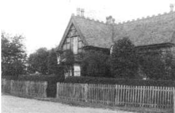
Fig. 1(a) – Midland Lodge in c. 1910 [Ref. 4309]

"New Lodge", as the cottage was originally called, had several tenants prior to 1886 when Benjamin Stone, Sutton Coldfield's first Mayor, took over the tenancy in order to meet the necessary residential qualifications to become a Burgess of the Town. During his four years as Mayor, 1886-90, the lodge was known as "The Mayor's Cottage" which he treated as his pied-à-terre, his own home being in Grange Lane, Erdington. After Stone terminated his tenancy in 1891 the cottage was referred to ever afterwards as "Midland Lodge".