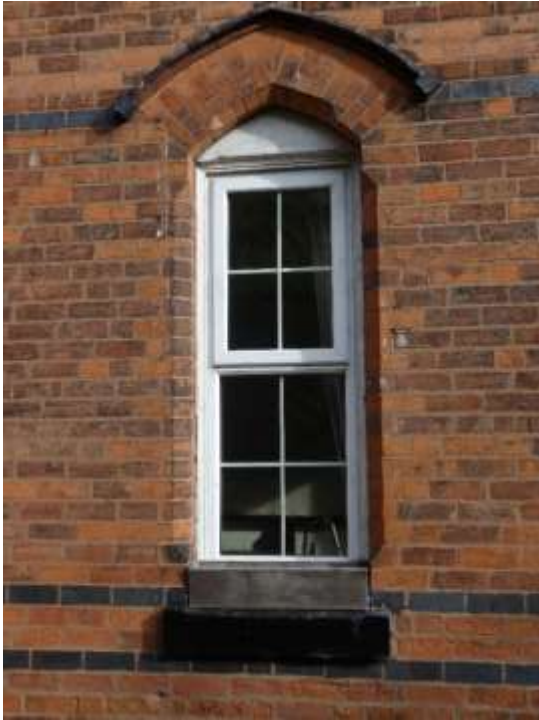
Fig. 14 – Side window of the south-facing reception room with Gothic Revival arched head. Note the decorative strings of blue bricks at the top and bottom of the window space.