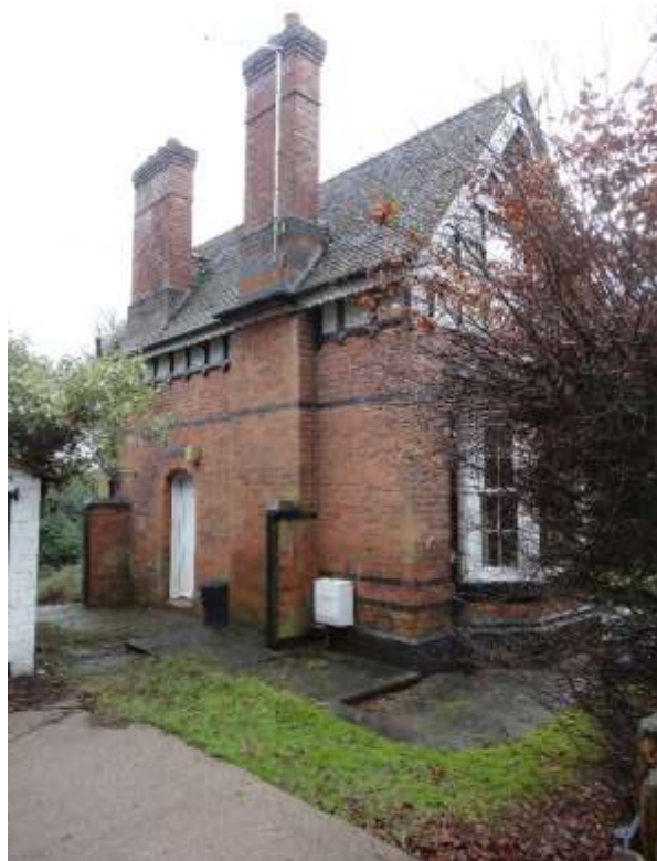
Fig. 18 – These gate portals on the northern wall would have provided a sizeable side entrance to the property and garden.