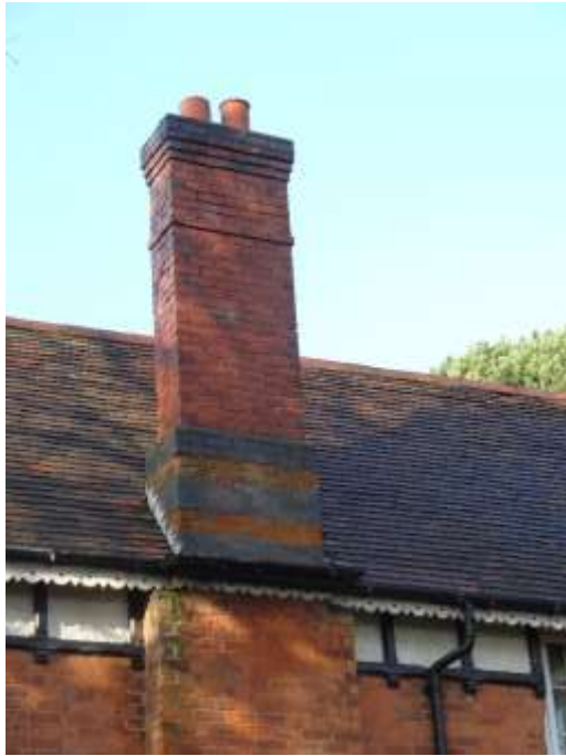
Fig. 11 – One of the three chimney stacks.

There are three plain, very tall, wide and slim, elegant chimney stacks, the two servicing the reception rooms having twin flues while the third one at the rear of the house has three