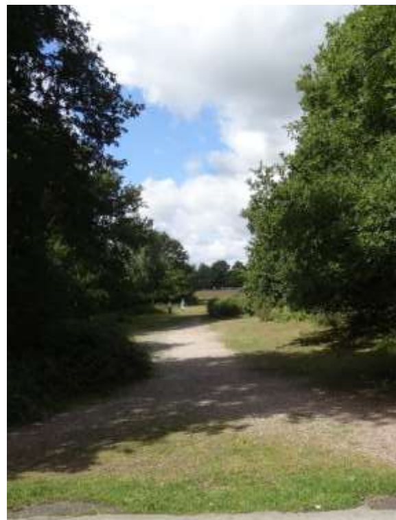
Fig. 5 – The cart road cut in 1880 from the railway bridge through the gorse of New Field to the Gravel Pit (seen in the distance) by Blackroot Pool. This provided a direct route to and from Midland Road.