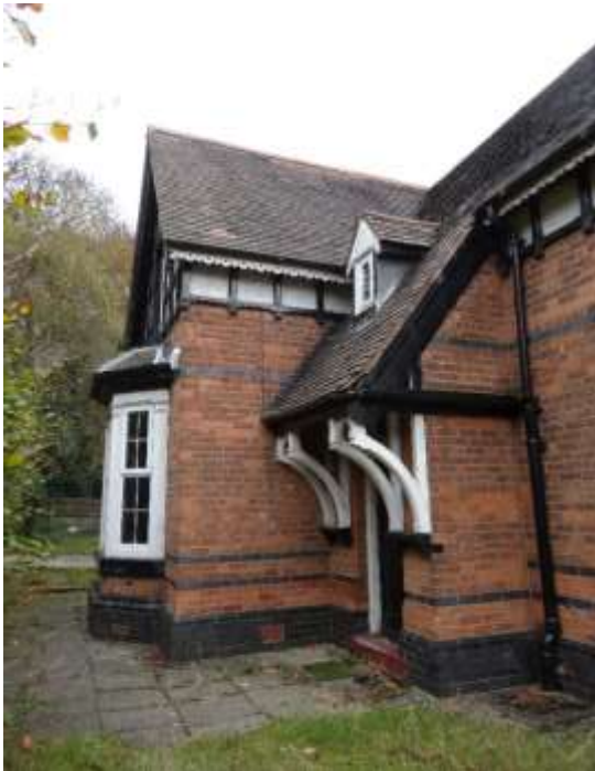
Fig. 12 – The front of Midland Lodge showing the blue-brick stepped base, the framed porch and the bay of the west facing reception room.

The original window frames have in recent years been replaced with double-glazed units using white UVPC fittings. Assuming that the contractors matched their replacements as closely as possible with the original window design, it seems likely that the major ground floor windows were originally of the sash type and multi-paned, whereas the upper were originally casement type. All of the ground floor windows have Victorian stone lintels. Sir Benjamin Stone's 1910 photo shows the bedroom windows to have been of the casement type with a pair to a window frame. The original glazing was two by three panels on each casement. The ground floor bay windows look to have been of the sash type with four over four window panes at the side and six over six for the west facing bay. However, as previously mentioned, the south facing bay originally had a large glazed door for access to the garden area.