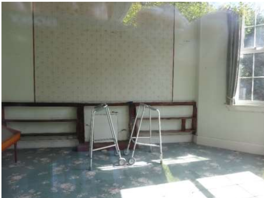
Fig. 20 – The same room in September 2014 photographed through the side window