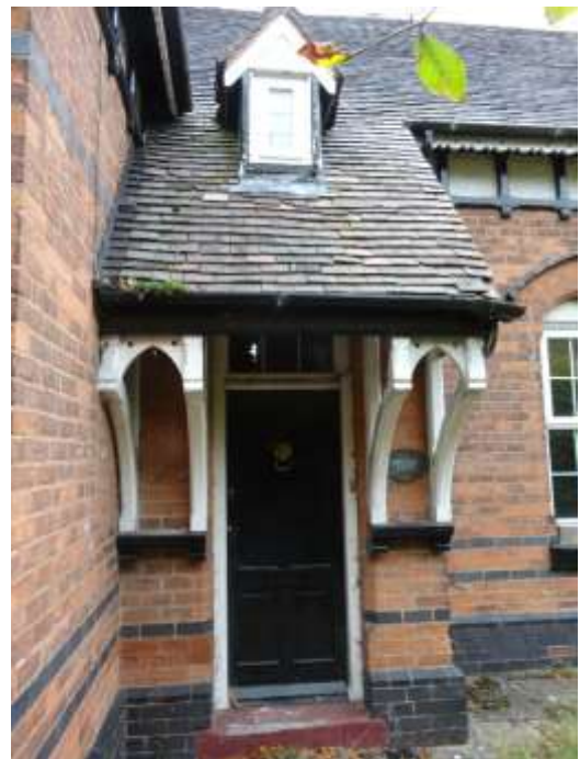
Fig. 13 – The front entrance showing the substantial fretted canopy supports and the gabled landing window over the front door.