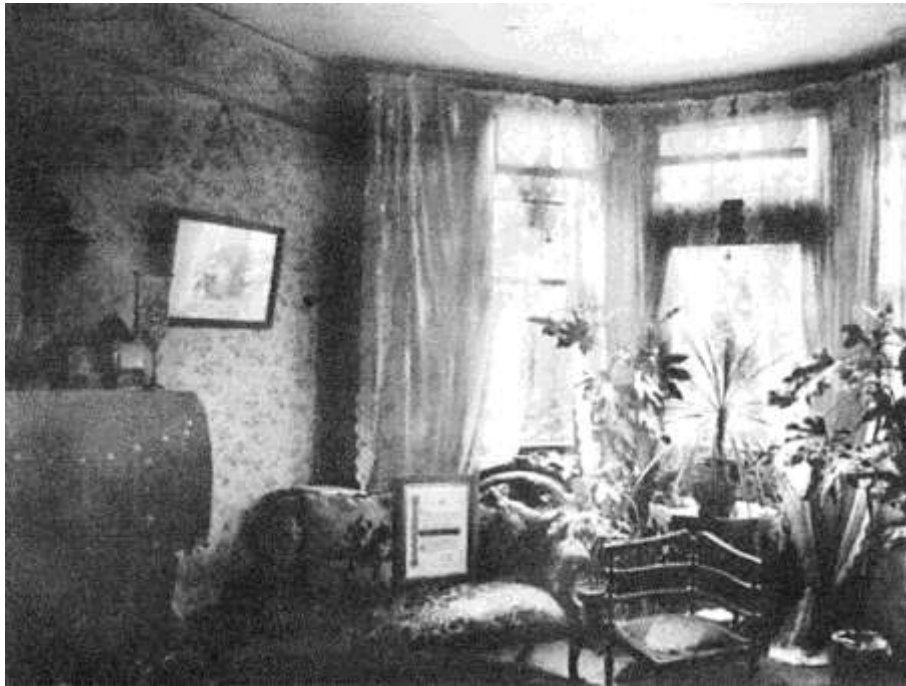
Fig. 19 – The interior of the south-facing reception room in c.1910. The original doorway to the garden can be seen.

The south-facing reception room is the most important room in Midland Lodge from a historic context. Fig. 19 shows a photograph taken by Benjamin Stone in c.1910 of the interior of this room. By way of comparison, Fig. 20, taken by the author in September, 2014, of the same room through the side window illustrates the sunny aspect of this room.