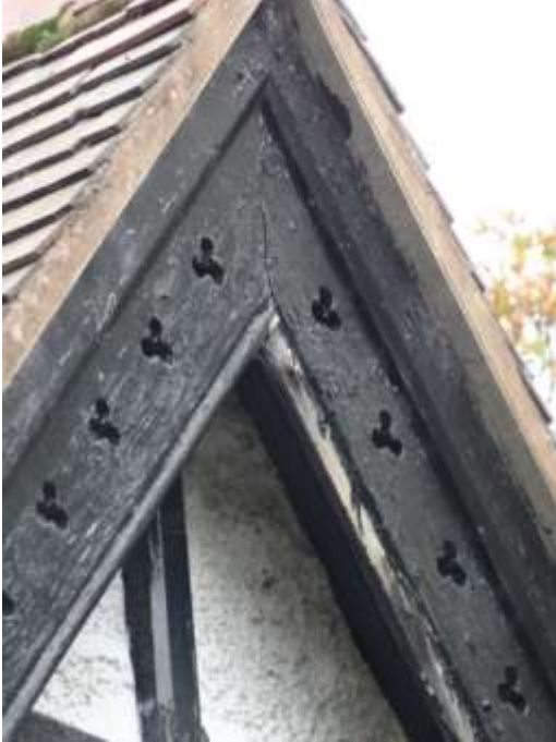
Fig. 8 – The bargeboards on the south-facing gable end showing clearly the clover leaf cut-outs in the bargeboards. The gable over the west front is similarly decorated.

The chimney pots shown on the 1910 photograph are yellow terra-cotta Crown Kings but likewise these have been replaced with plain round red terra-cotta pots. Now, the timber-framed patterns are painted black with white stucco infill panels but originally the timber would probably have been painted green or brown with the stucco left in its natural condition. The present-day arrangement would appear to present a more dramatic effect.