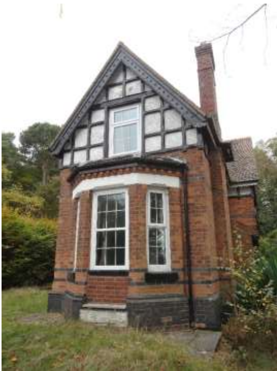
Fig. 16 – The south facing aspect of the cottage. Note the bricked-in doorway of the bay window that originally led into the garden, and the terracotta dentil dressings above the lintels.