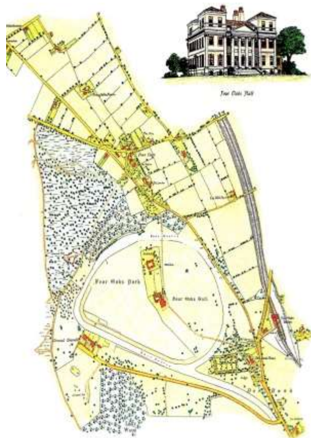
Fig. 6 – A map of Four Oaks Hall and Racecourse pictorially adapted from the 1887 Ordnance Survey Map of Sutton Coldfield which appears on page 31 of their 2011 publication “The Environs of Sutton Coldfield – A History in Maps” by Mapseeker Archive Publishing Ltd. [ISBN 978 1 8449 1780 8]

During Easter week of 1886 the total number of visitors to the Park was officially recorded as 23,693 of which 1,843 entered via Midland Gate. 14 It was shortly after this that the Four