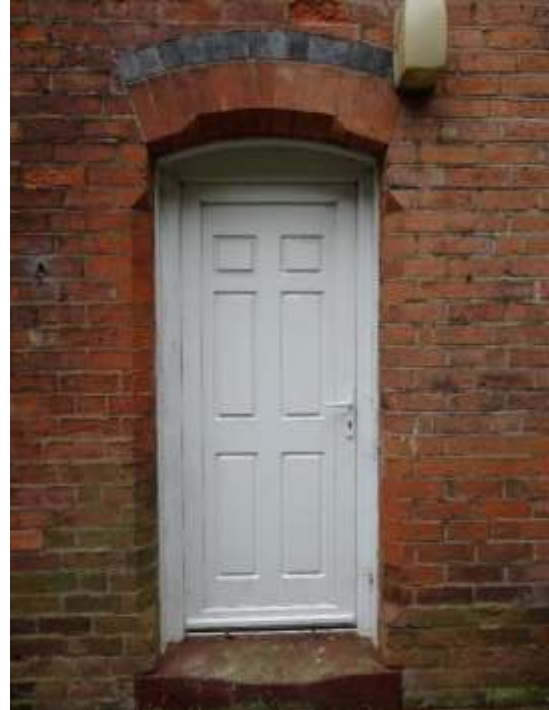
Fig. 15 – The north side-door illustrating the segmental arch with equal voussoirs, surmounted by a string of blue brick headers and chamfered surrounds.