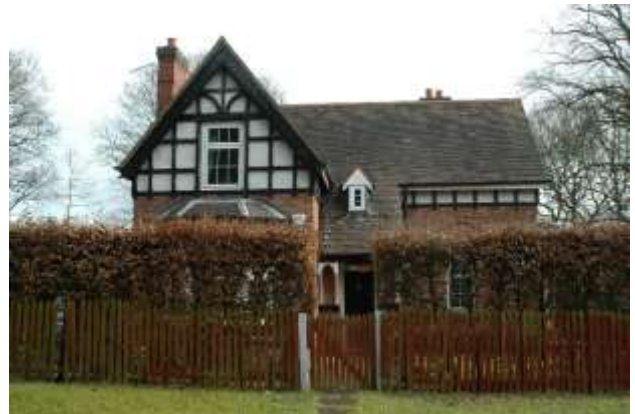
Fig. 1(b) – Midland Lodge in February, 2014