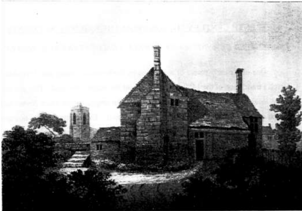
St. Mary's Hall.