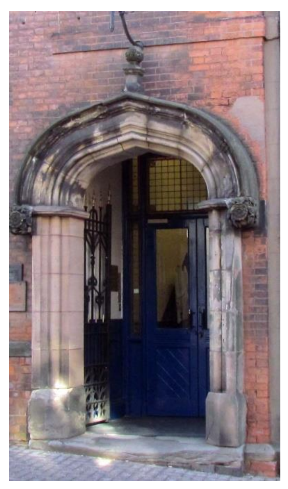
Tudor Rose bosses on either side of the archway to the main entrance of the first Town Hall in Mill Street, now known as the Masonic Hall.