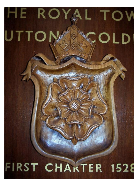
Coat-of-arms in Sutton Coldfield's first Town Hall in Mill Street.